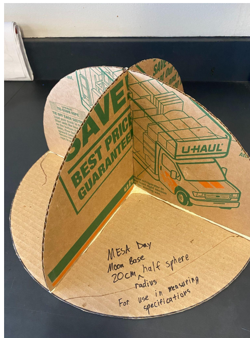
Fig 2. Sample internal measurement tool.