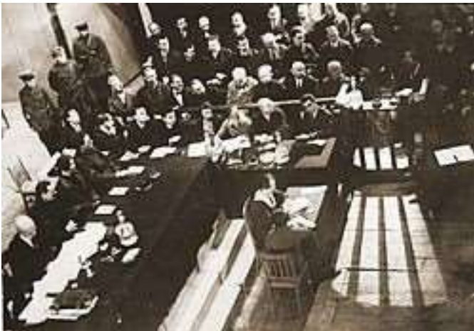
The SVU Trial, 1930.

The purpose of this man-made famine was apparently twofold. First, the regime sought economic control of the Ukrainian farmers, who in general, favored individual enterprise and opposed collectivization. Second, it sought political domination over the Ukrainian people, who on the whole desired independence and resisted Russian rule. The famine achieved both.