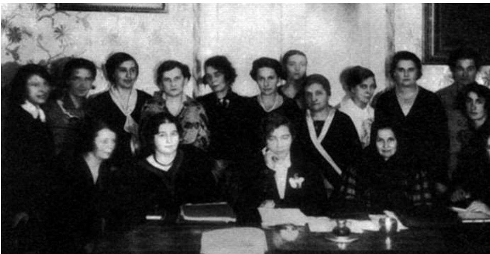
Union of Ukrainian Women presidium (with Milena Rudnytska in the center). Source: Lidiia Burachynska, "Union of Ukrainian Women," Encyclopedia of Ukraine , vol. 5 (1993).

Source: U.S. Commission on the Ukraine Famine, Investigation of the Ukrainian Famine, 1932-1933: Report to Congress (Washington, DC: US GPO, 1988), p. 176. Torgsin was a web of special state-run stores, established in 1932, to extort gold and valuables from the population in exchange for food and foreign-made products. The term is an abbreviation from "torgovlia s inostrantsami" (translated as "trade with foreigners"). An estimated 33 tons of gold and 1,420 tons of silver were extorted from Ukrainian villagers to pay for imported American and European goods and industrial equipment.