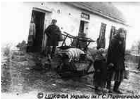
Dispossessed family near their own house in the village Udachne, Donetsk region, 1930s.