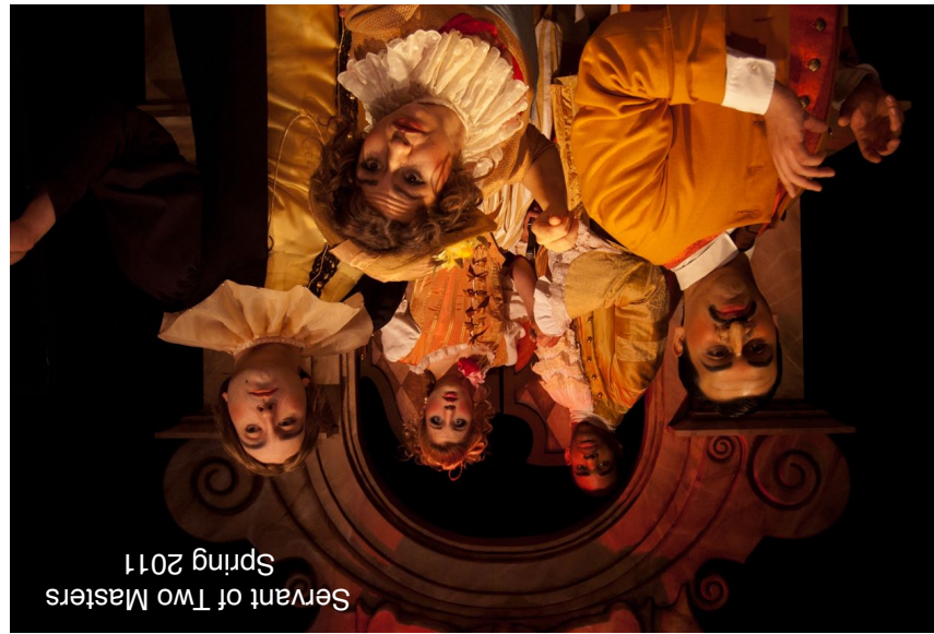
Servant of Two Masters Spring 2011