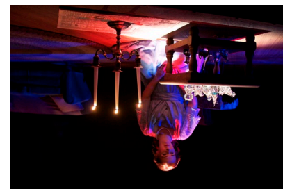
The Glass Menagerie Spring 2011