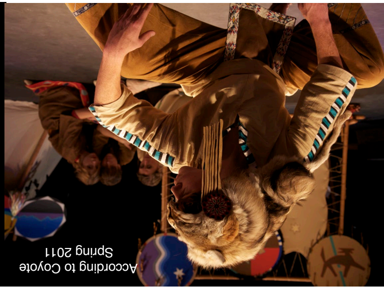
According to Coyote Spring 2011