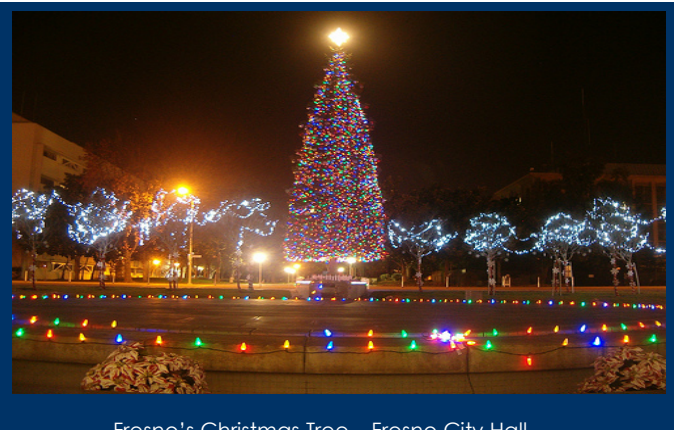
Fresno's Christmas Tree - Fresno City Hall