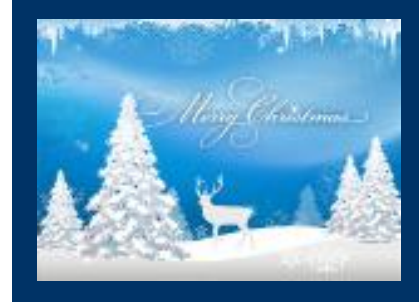
SSS Staff wish you and yours a blessed and Merry Christmas!