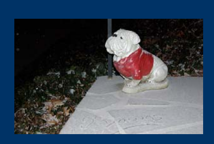
Even Bulldogs love winter in Fresno!