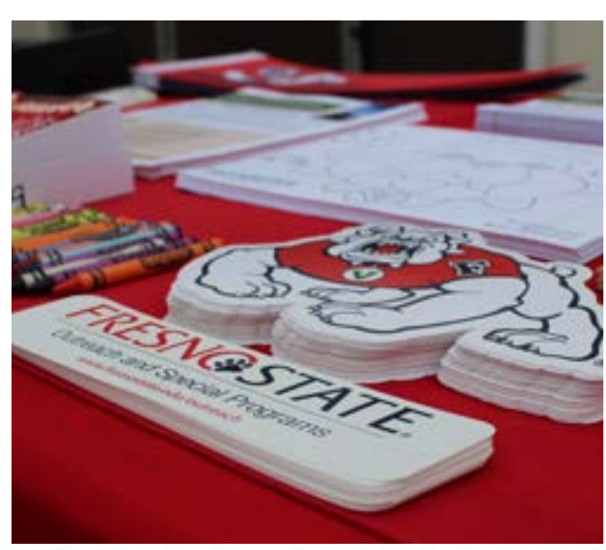
OSP information booth.