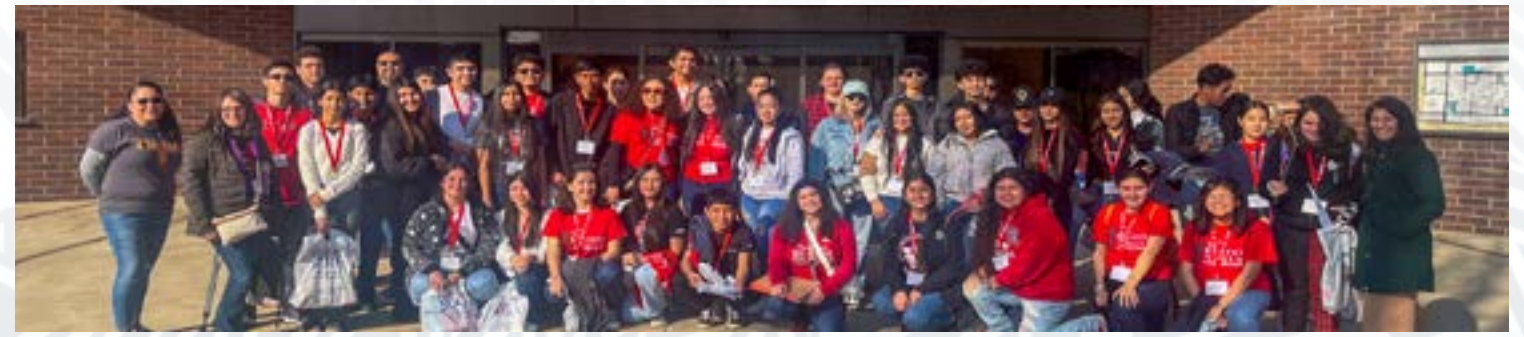
Educational Talent Search - Fresno after the 50th CYC.