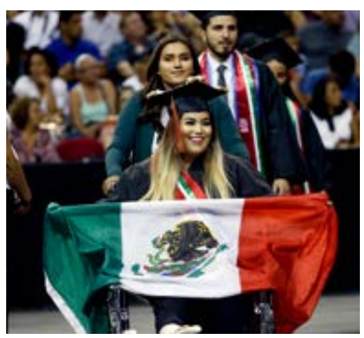
Student during latino commencement