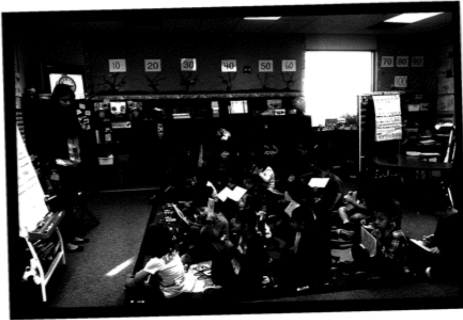
Holistic Proficiency Project – TPE 5 pictures (see other file for other documentation)