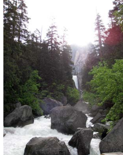
A beautiful start to a beautiful day!