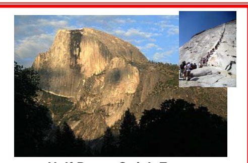
Half Dome Quick Facts

Hike Distance: 16.5 miles (26.5 km) round trip