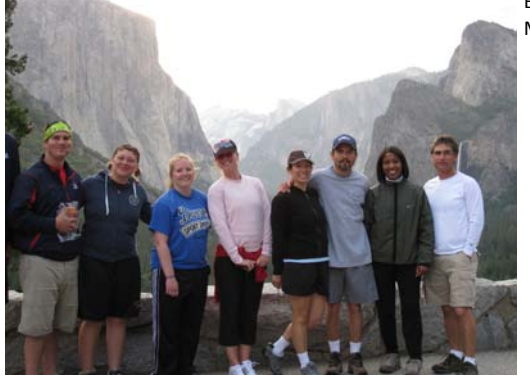
Saturday, May 30, 2009