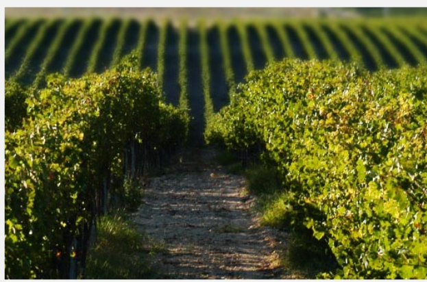
A vineyard in the Puglia region of Italy

The program is open to students from North American colleges and universities and is cross-disciplinary in nature.