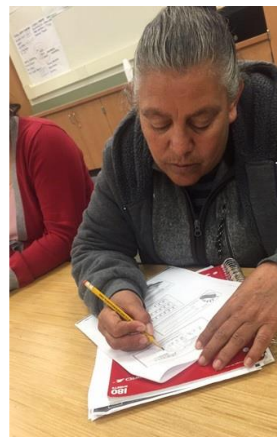
Students also practice literacy skills