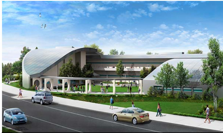
Schematic design by Arthur Dyson and Associates

University High School: (Currently on hold due to the budget crisis) California State University, Fresno will construct a one-story, $15 million, 37,500 GSF facility for the University High School. This project will provide classrooms, science labs, and a computer music room. It will also contain a music center which houses three rehearsal rooms and an administrative center which houses the principal, support staff, faculty, and counseling support personnel. In addition, the project includes a circular drive at Maple Avenue that will allow for greater flow of traffic. The completion of this project will allow the high school to vacate the temporary trailers that currently house the student population of 400 students. The building is sited between the Smittcamp Alumni House and the Joyal Administrative Building, north of Matoian Way.