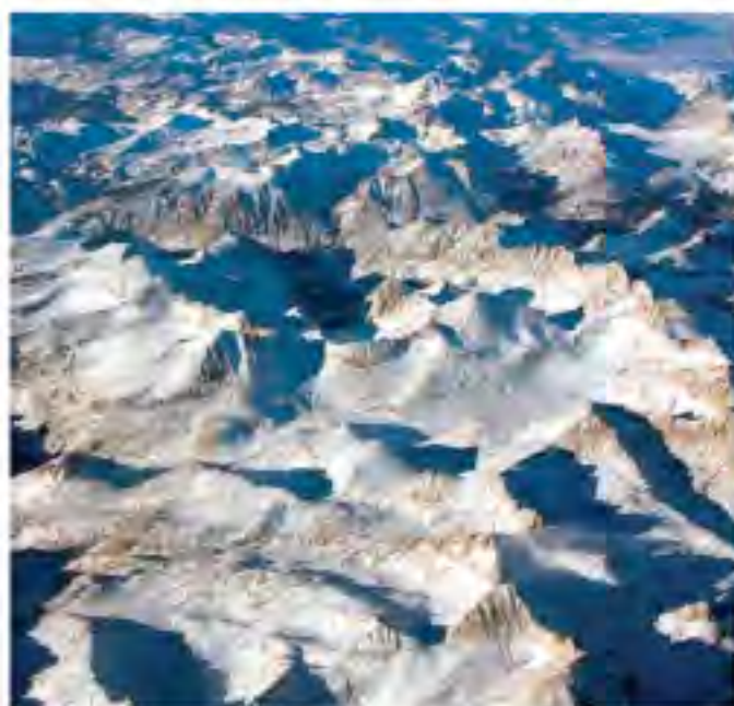
The U.S. Sierra Nevada.