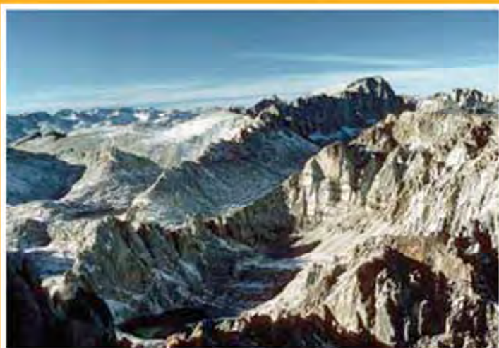
Looking north toward Mount Whitney and the Sierra Nevada from Mount Langley, California, USA.

www.geosociety.org/Sections/cord/2013mtg/