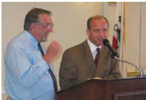
Fall 2005 Orientation Event

We have an exciting schedule of activities that will challenge, inspire, and motivate you—why not join us today?