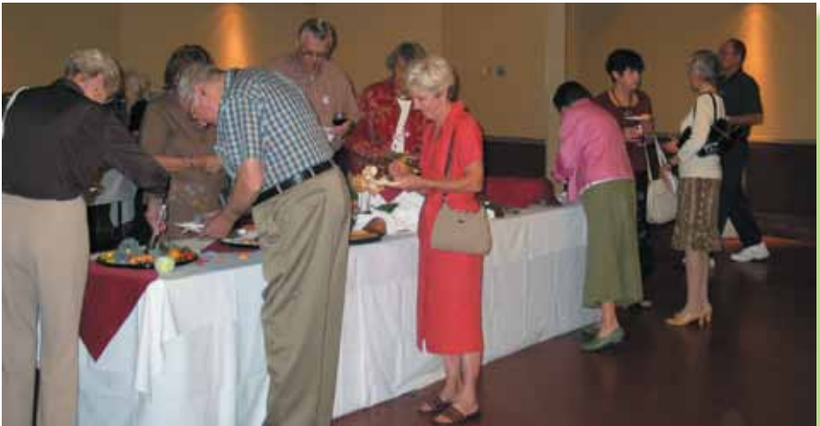
OLLII members enjoy a reception prior to Victor Davis Hanson's lecture.