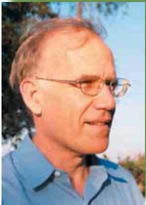
Victor Davis Hanson