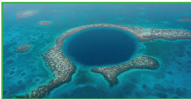
The Great Blue Hole

Participants in this program must have a valid passport. Those needing a U.S. Passport can apply in the Continuing and Global Education office, located in Kremen Education Building, Room 130.