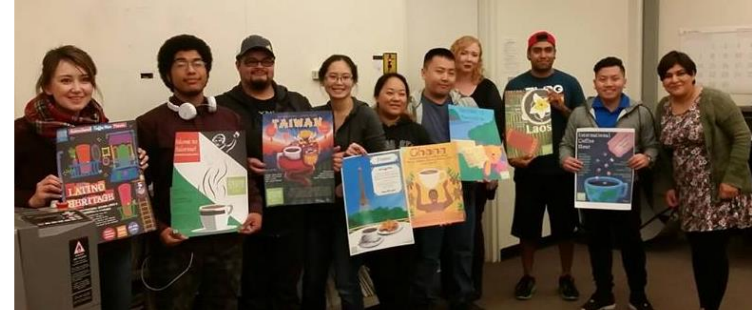
Graphic Design/Art students create our ICH weekly posters through collaborative partnerships with faculty.

International Coffee Hour (ICH) endeavors to bridge the gaps between academic & student affairs by cultivating partnership & leadership opportunities, while fostering intercultural exchange amid campus & local communities.