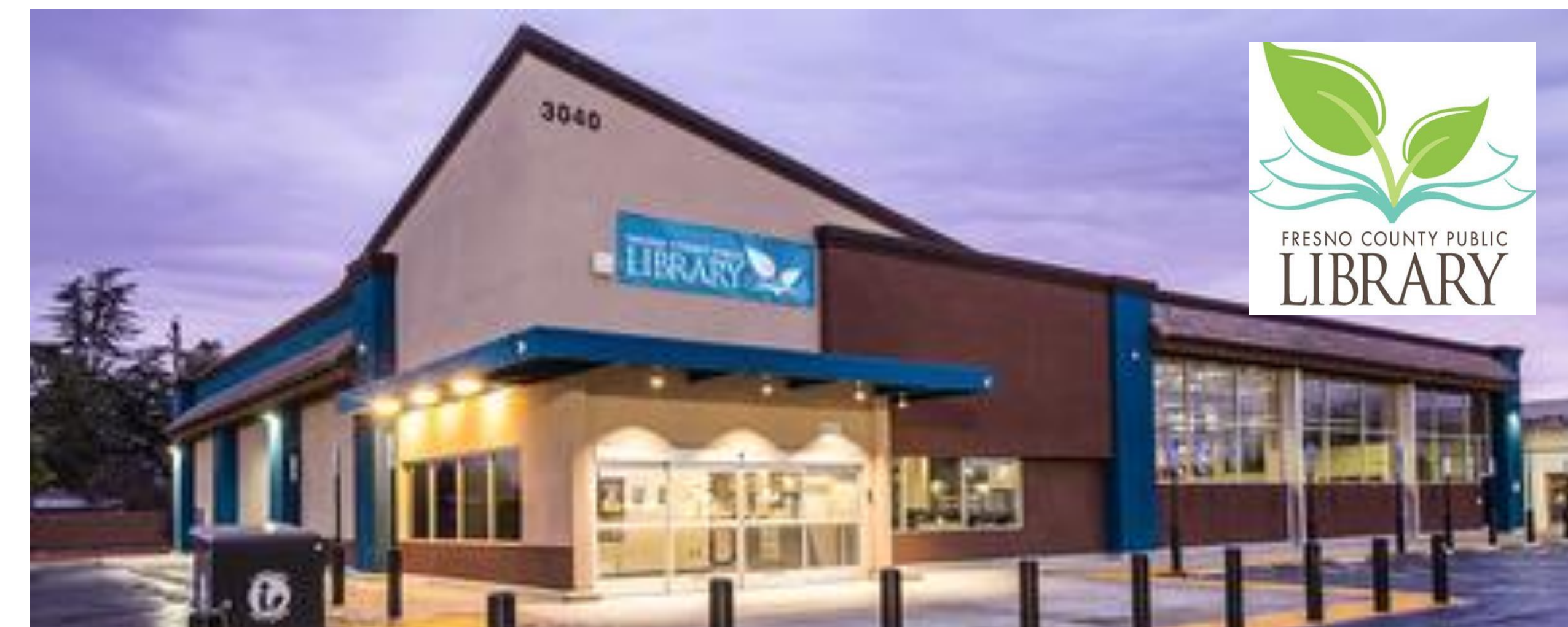
New Projects: Expanding our community outreach by partnering with local librarians & hosting additional ICH sessions at local Fresno County libraries