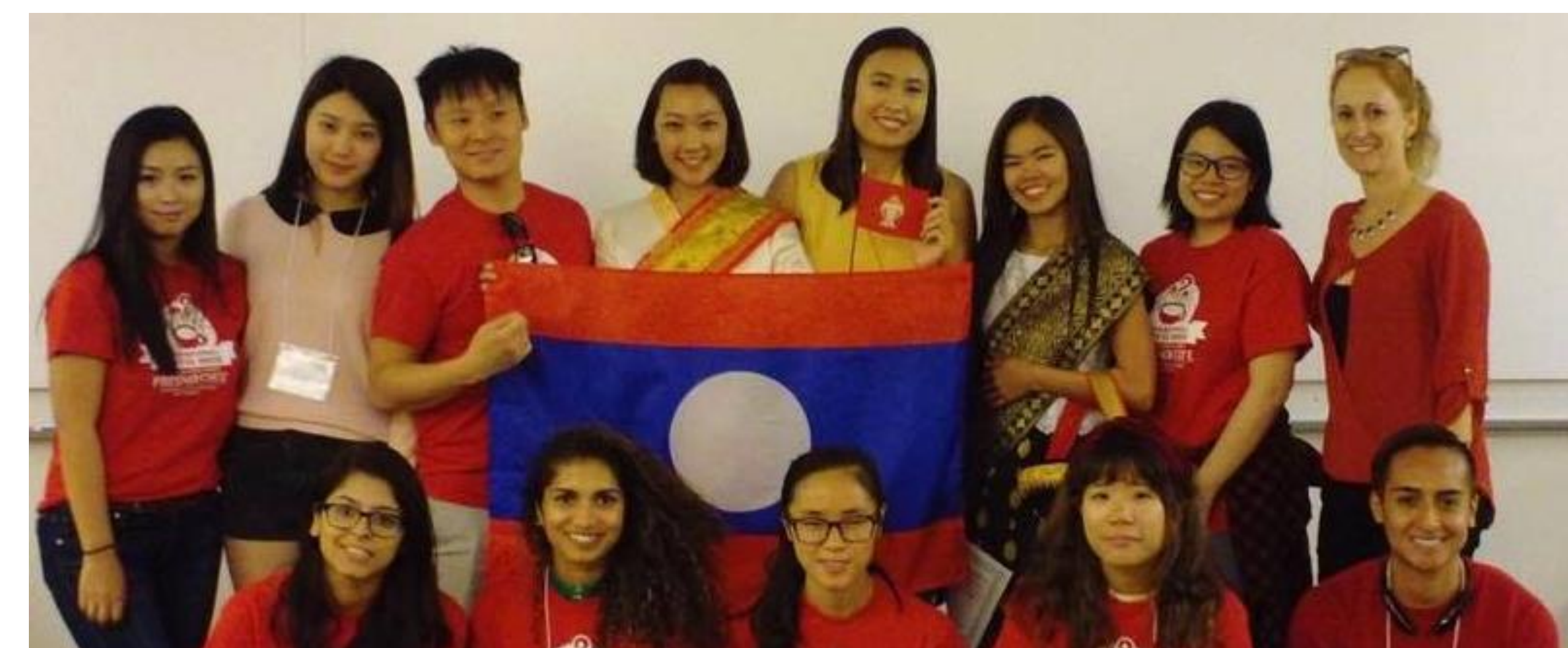
Student volunteers from around the world make ICH possible.

The tradition & innovation of ICH continues as we identify new collaborative partners & library resources not typically utilized in international programming. With the support of the Library Diversity Committee, ISSP provides international & study abroad students with a medium to share their cultural experiences & backgrounds, while participating in professional development activities & connecting with the community.