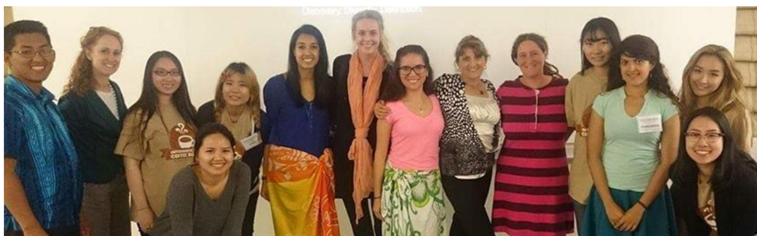
Service Learning participants & professors share their cultural experiences at ICH.

The tradition & innovation of ICH continues as we identify new collaborative partners & library resources not typically utilized in international programming. With the support of the Library Diversity Committee, ISSP provides international & study abroad students with a medium to share their cultural experiences & backgrounds, while participating in professional development activities & connecting with the community.