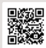
NetBenefits® for iPad