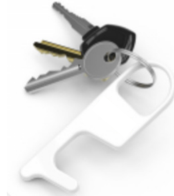
SAMPLE TOUCH TOOL

(You may still use the registration form in this online catalog and mail in your registration; however, the gift is only for those who register online.)